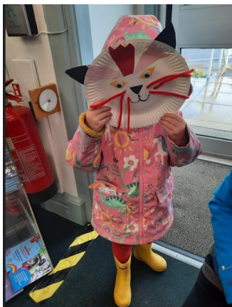
If we had a 'picture of the season'... this would be it!

April's story trail 'Nala's World' introduced the children to one little cat's quest for love and adventure. The children were read the book and then enjoyed a walk to the People's Park, followed by crafts at the library. These popular story trail activities offer two sessions so two different groups can enjoy the experiences.